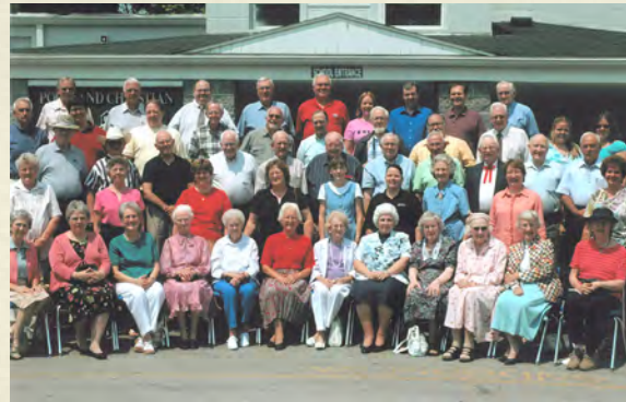
2007 Church Leaders Kentucky/ Indiana Fellowship

Also, classes for 4 year old to 5th grade will be provided by area churches.